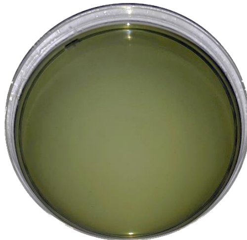
Marine Vibrios Plate Count ( SIL-LIFE Dilute 3ppm After 1 hr )

Unless otherwise stated the results shown in this test report refer only to the sample(s) tested. This test report cannot be reproduced, except in full, without prior written permission of the Company. 除非另有說明，此報告結果僅對測試的樣品負責。本報告未經本公司書面許可，不可部份複製。